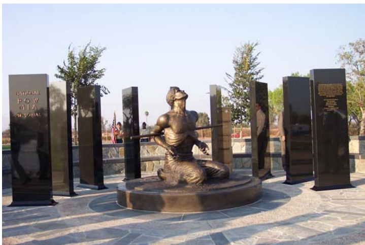
Visit the West Coast POW/MIA Memorial At Riverside National Cemetery.